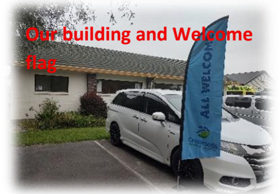
Our building and Welcome flag

One of our attendees comes to our service after attending early mass at the Catholic Church. She doesn't agree with much of what is taught there, but she continues to attend because she is in her 80's and is considered one of the "respected elders" in the church. She fears the conflict that would arise if she left. She told one of our church