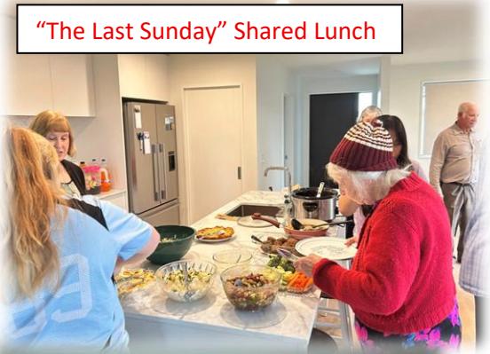
"The Last Sunday" Shared Lunch