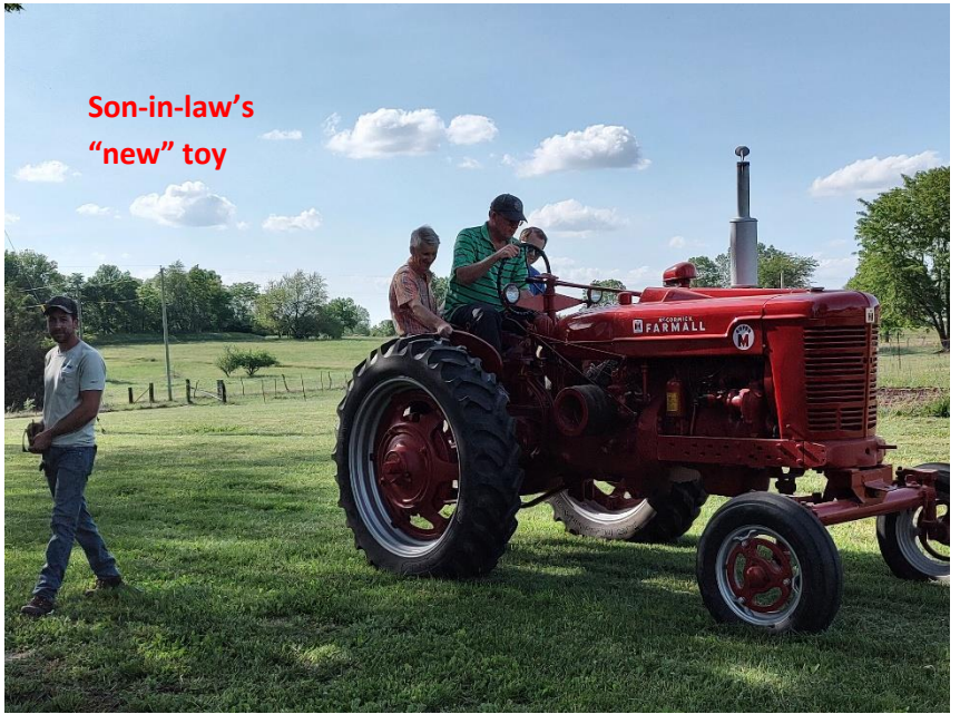
Son-in-law's "new" toy