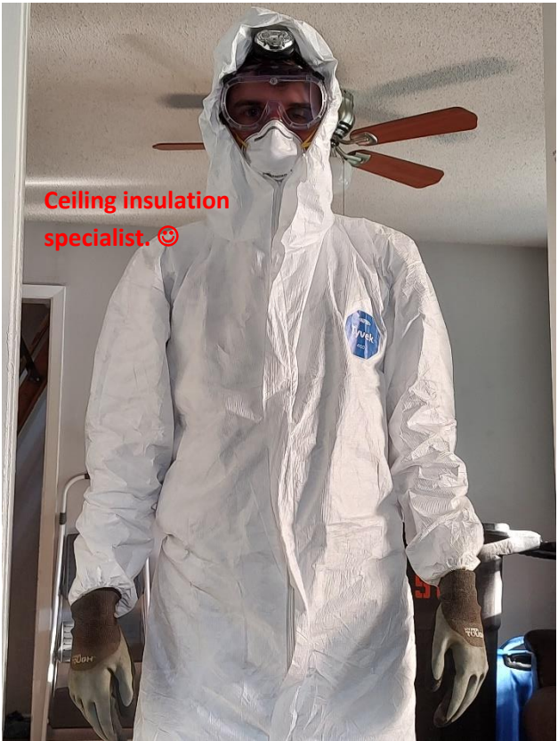
Ceiling insulation specialist. 😊