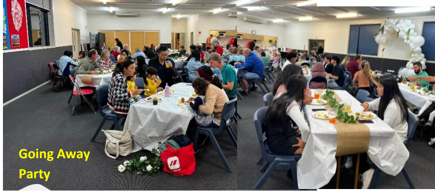
Going Away Party

We jumped from falling leaves to budding trees in just 24 hours! April was an emotional rollercoaster as we said goodbye to those we have poured our lives into and made our move back to the United States of America. We know God has a plan for us, He has made it clear that it was time to return. But I must admit, we feel a lot like Abraham must have felt, going without knowing!