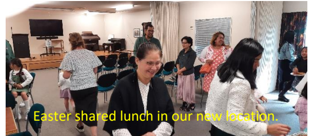
Easter shared lunch in our new location.

found a new location for our church services on Sunday mornings. April 2 nd was the first service in the new location. It was