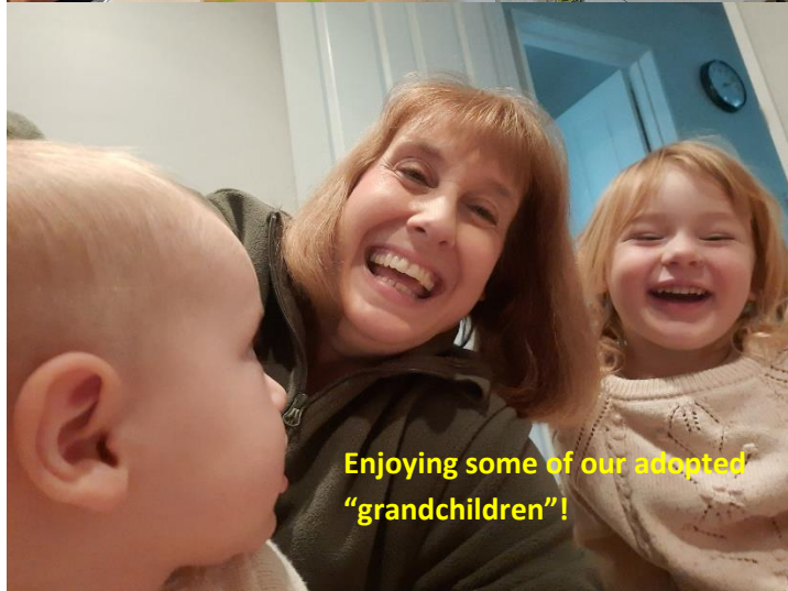
Enjoying some of our adopted "grandchildren"!