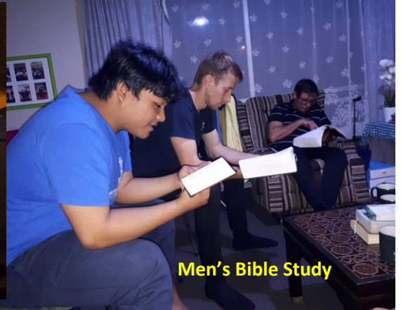
Men's Bible Study