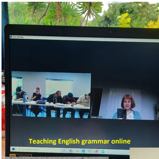
Teaching English grammar online