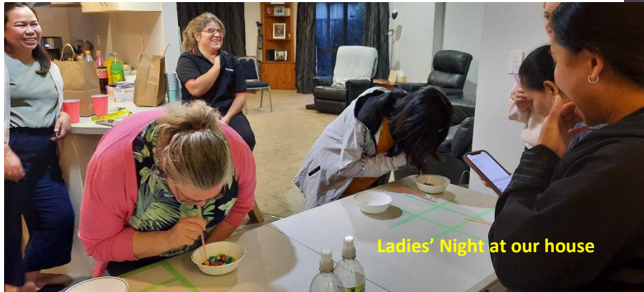
Ladies' Night at our house

Thank you for remembering us in prayer! Feel free to send prayer requests for us to take to the Lord on your behalf.