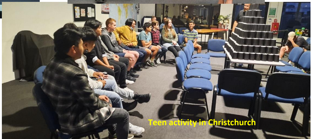
Teen activity in Christchurch