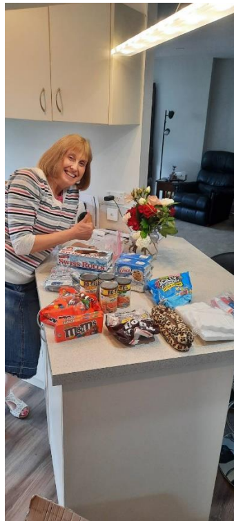
Shout out to a supporting church that sent the care package! Saved the last one for a special occasions! Fishing at Lake Heron