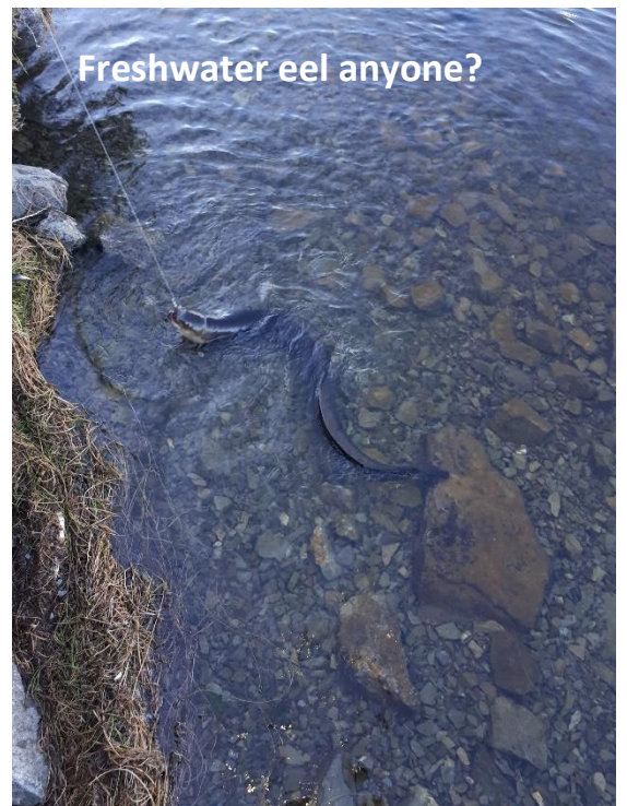
Freshwater eel anyone?