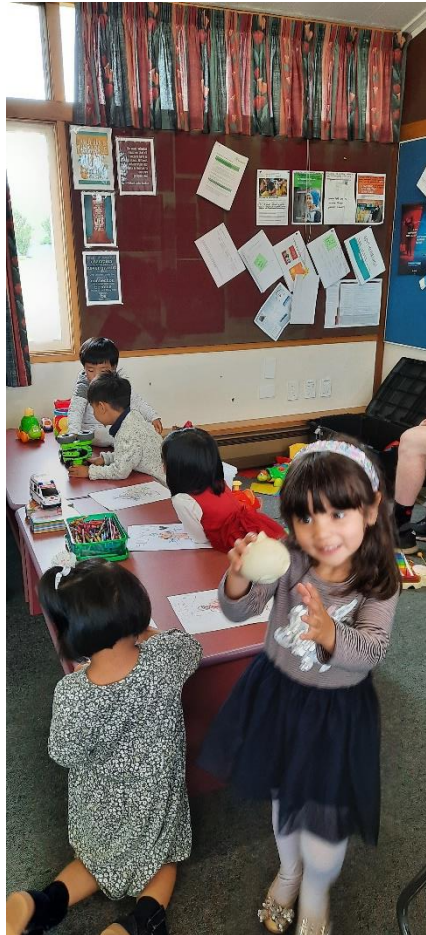
Kid's club included the 3 year olds.