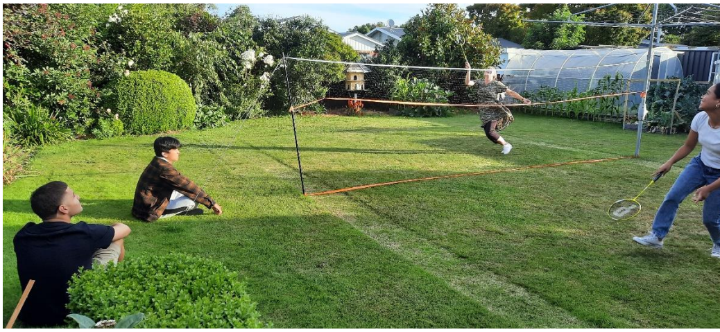
Teen activity, badminton in our back yard. Notice the garden which is producing very nicely right now!