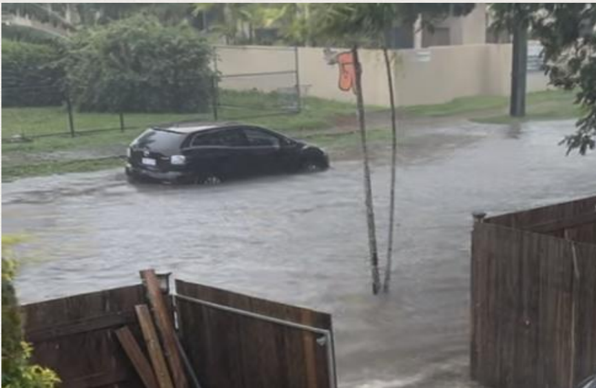
(A road in Townsville flooded on February 1, 2025)

Our wet season was late but has started with a bang! Over the weekend, Townsville and surrounding areas received nearly 4 feet of rain and there is more rain on the way. While only one family in the church had to be evacuated because of possible flooding, many streets were covered with water (as photo below shows) and were dangerous to drive on. For church on Sunday, we recorded a sermon and sent links to all the people who would attend. Because it happens almost annually, most people do not panic and just stay home until it is safe to be out. Please pray for us as we deal with more wet weather.