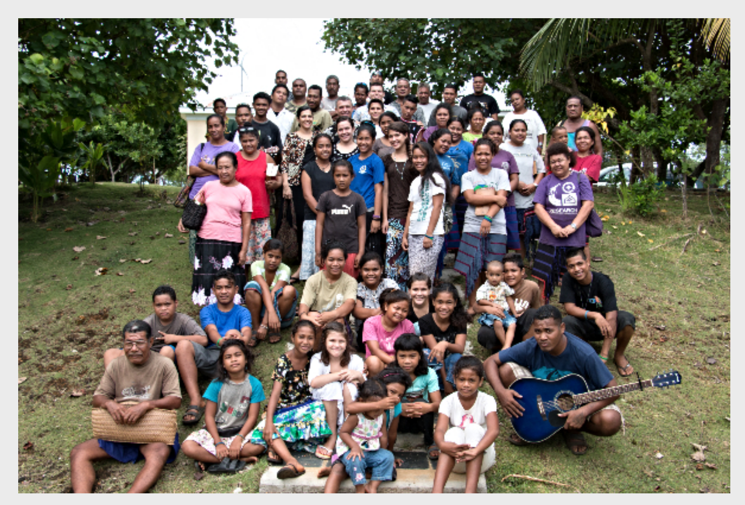
We will be ministering at Faith Baptist Church