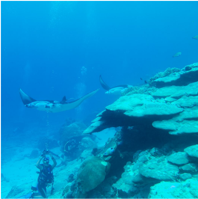
Manta Rays on a Scuba Dive