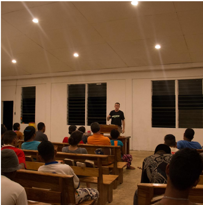
Preaching at Youth Meeting on Yap