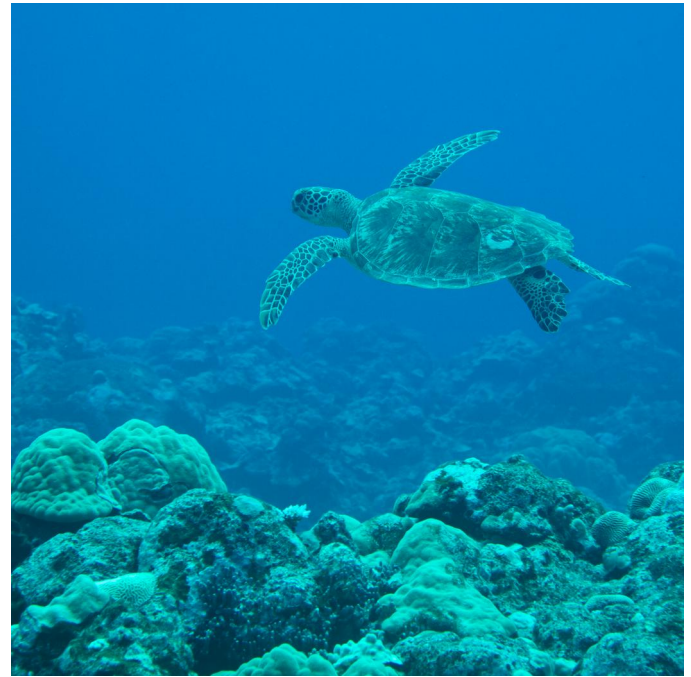
Sea Turtle on a Scuba Dive