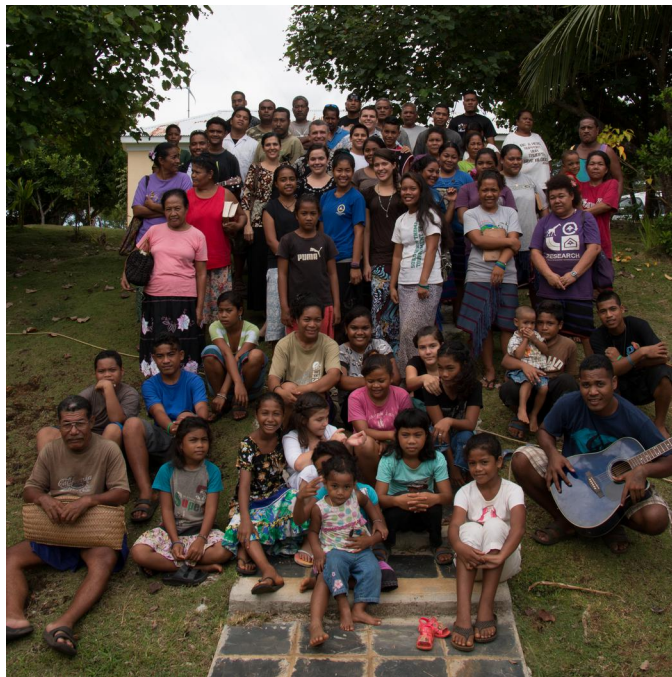
Faith Baptist Church on Yap