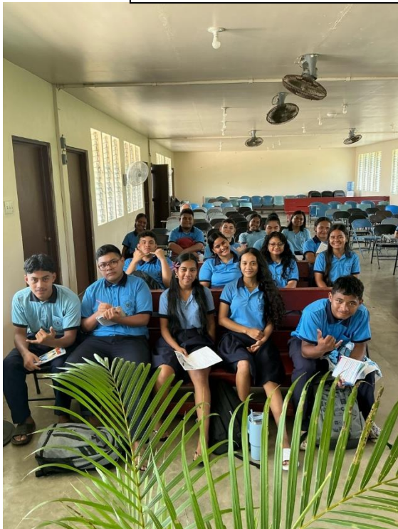
Below: My 11 th and 12 th grade bible class