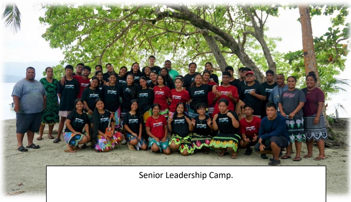
Senior Leadership Camp.