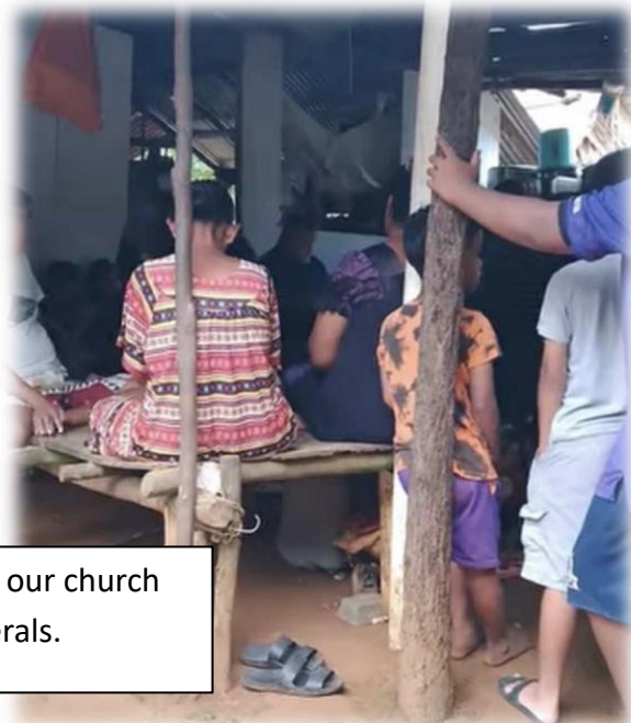
Preaching at one of our church family's funerals.