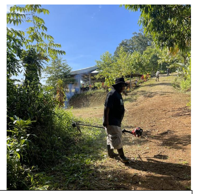
Above: Cleaning our church building and its surroundings.

Below: Good News Baptist Church special event during our four-day meeting.