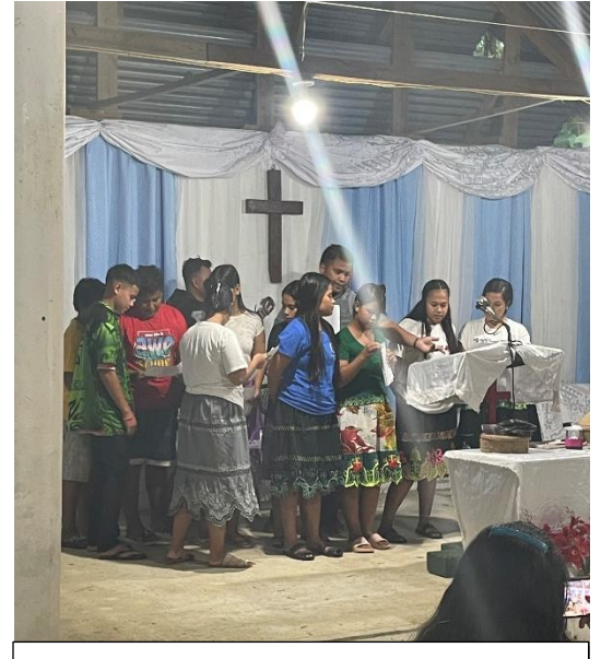
At Ambassador Baptist Church, our youth are singing a special song.

Below: Using the new flatbed to haul the pews to the new building.