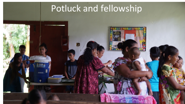
Potluck and fellowship