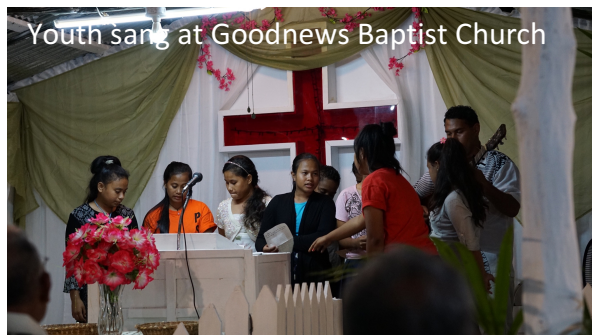
Youth sang at Goodnews Baptist Church