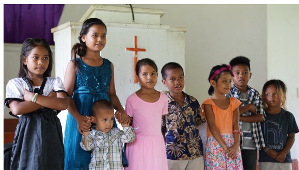
Children singing special