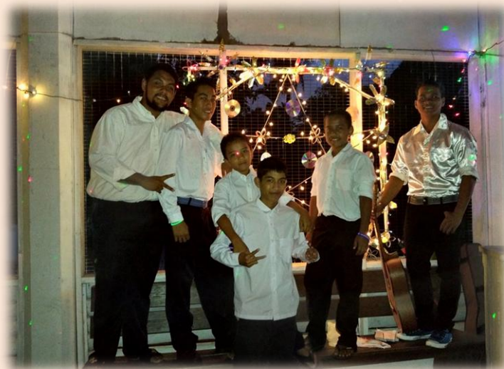
The boys getting ready for their Christmas program