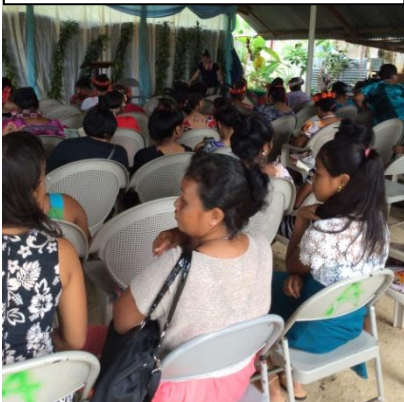
Mother's Day...hosted by Ambassador Baptist Church