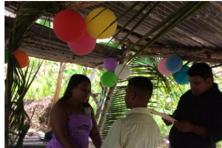
Performing a wedding ceremony..