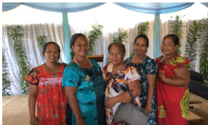
Mothers from Good News Baptist Church and Wone Baptist Church.