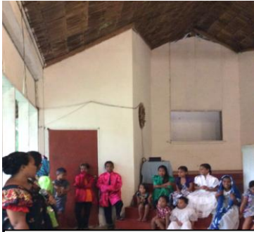
Sunday School presentation