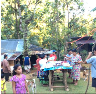
Privilege to be invited to a farewell dinner and share the Word too.