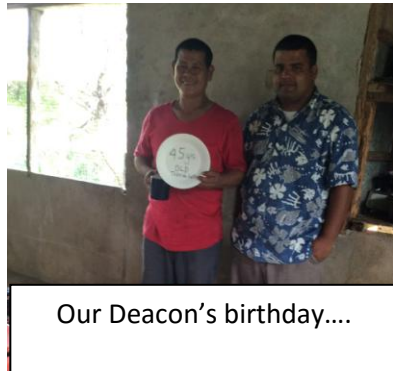
Our Deacon's birthday....