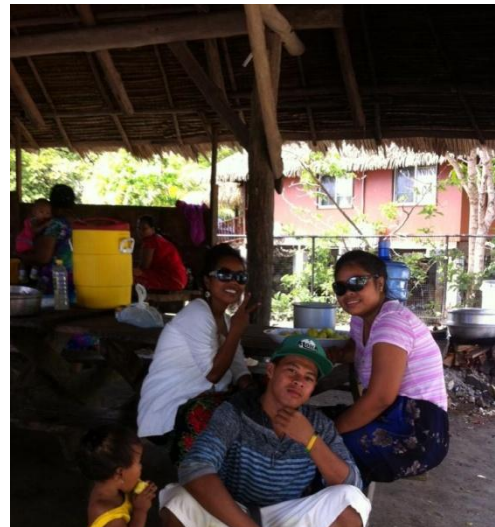
Wone Baptist church picnic.