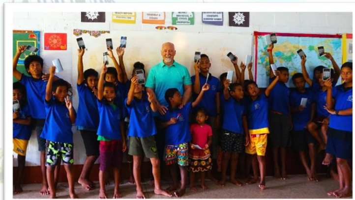
The children of the Nukuoro Island School eagerly receiving Gospel tracts!