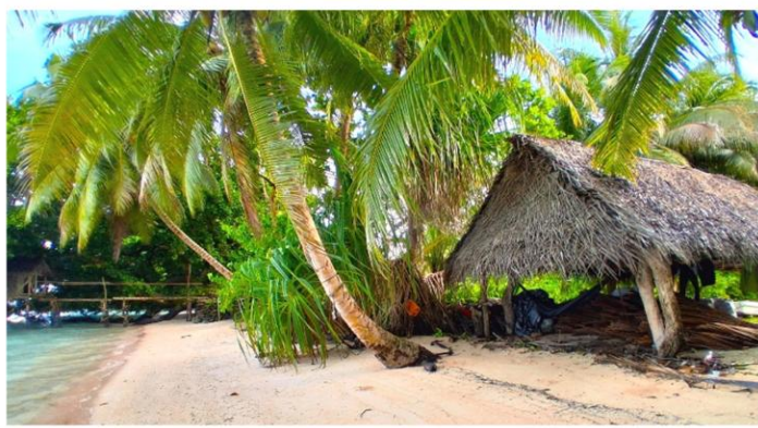
Island Accommodations: Outhouse on the left side & my hammock in the boathouse on the right