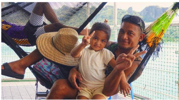
Imagine traveling on an open-air ship, sleeping in a hammock the way most Islanders do!