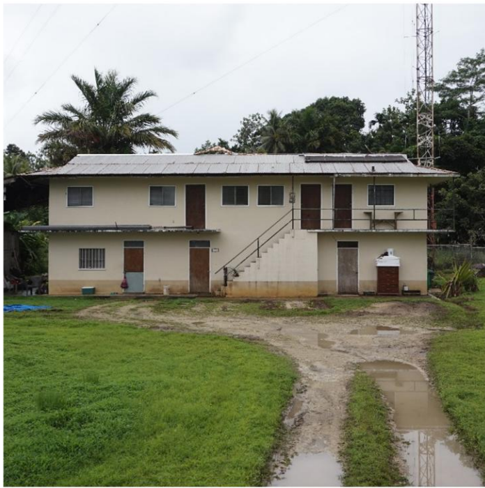
Radio Station prior to Renovations.