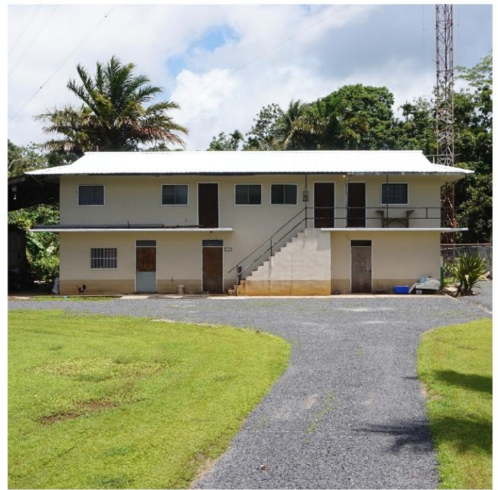
Progress! The Baptist Radio with a new roof & driveway resurfaced.