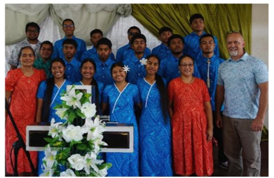
Preaching to the MBCA class of 2025'

"Hear the word of the LORD, O ye nations, and declare it in the isles afar off..." - Jeremiah 31:10