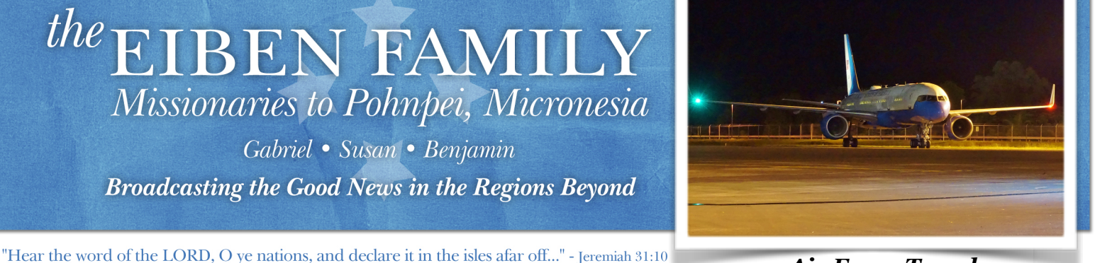
Air Force Two, here on Pohnpei, Micronesia!

Broadcasting the Good News in the Regions Beyond