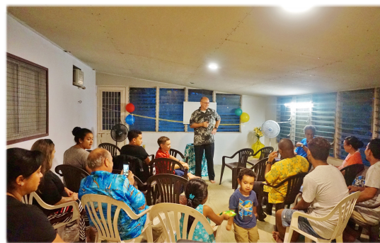
Wednesday night ribbon cutting on the back porch!

Broadcasting the Good News in the Regions Beyond