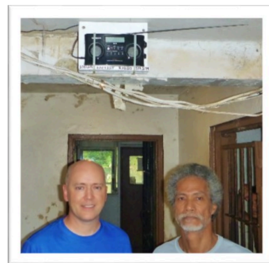
Baptist Radio in the Local Prison, Amen!