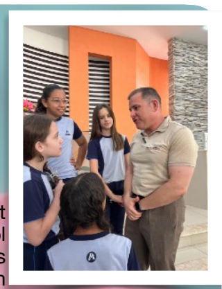
Talking to kids at a local school about the dangers of Halloween