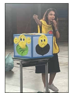
High School Teens in Cruzeiros do Sul