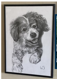
A gift from a neighbor—a drawing of Riley!