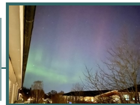
Northern Lights from my balcony