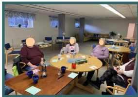
From a ladies' meeting!