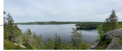
A nearby lake

Dear Praying Friends, Happy Summer! I hope you are all staying cool and enjoying these months wherever you may be! Summer here means longer days, therefore being able to visit with more neighbors as everyone spends a lot more time outside. Every night after walking our dogs, a few of us will sit outside until sometimes 10.30 or 11 just visiting and enjoying the evening light.