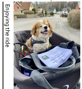
Enjoying the ride