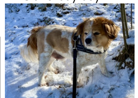
The birthday boy