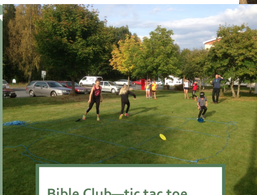
Bible Club—tic tac toe