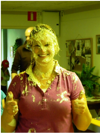
The kids' reward for earning points during the week—throwing pies in my face!