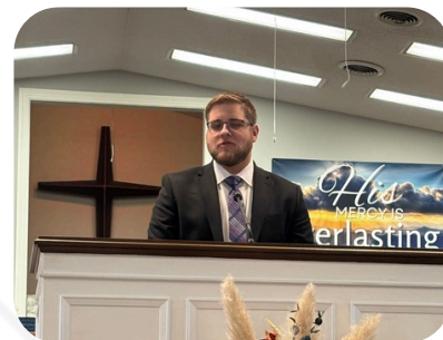
FBC in Greenville, SC