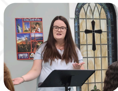
Ladies Fellowship in GA