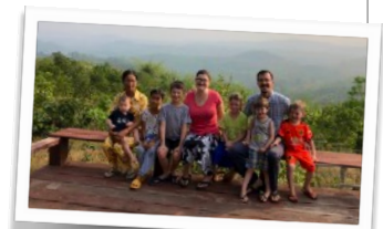
Khmer New Year Fun