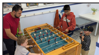
Fun no matter your age!