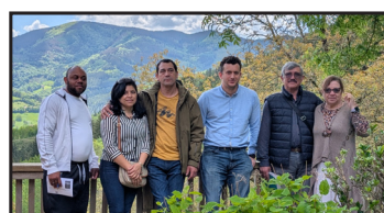
Believers from church at an Intensive Institute at the Aierdi Farmhouse