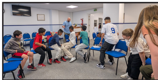
Youth meeting at church

We’ve reached an exciting new chapter in church. We’re now holding youth group meetings every other Saturday! We have a core group of four 12/13-year-old boys in the congregation, and they’re happy to meet for a time of Bible study, singing, and games. They’ve even brought several unsaved friends to the meetings! Pray that the current excellent spirit will continue, and that the Lord would