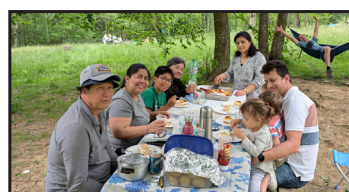
Picnic lunch with church members