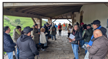
Praying for the Basque Country with believers from several churches