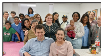
Believers at church at a surprise celebration of our anniversary