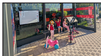
Waiting for the bus after running out of fuel