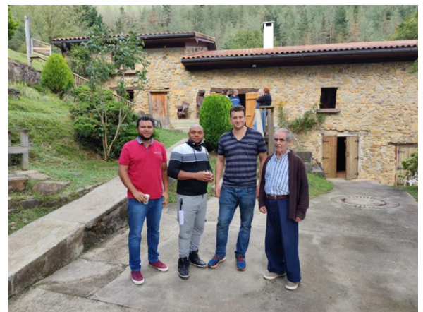
Me with 3 church members at a regional Bible study (Intensive Institute)