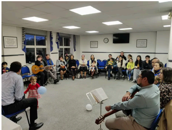
Combined church fellowship activity with a new Baptist church plant in Hondarribia