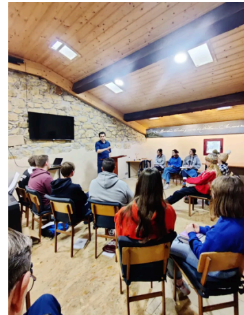
Teaching at the Missionary Teen Retreat at the Aierdi farmhouse