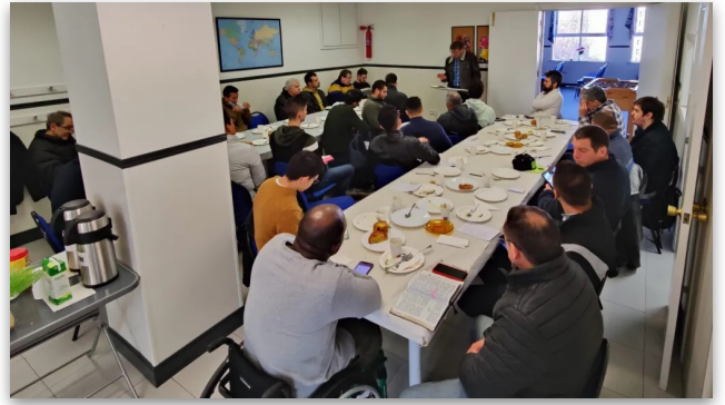
Regional prayer breakfast