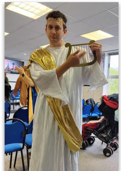
I was the evil emperor Nero in our Easter cantata