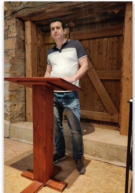
Teaching at the apologetics retreat

In April we held our third annual apologetics retreat during Easter break. We had a great group of believers come from different parts of Spain for 3 days of sessions about being prepared to explain our faith in a world that scorns faith. The topics have varied a lot in these three years, and in my session this time I spoke about the supposed tension between the theologies of Jesus and Paul. Virtually everyone in Spain studies in a totally secular environment where the Bible is under constant attack via arguments like these. We hope these apologetics sessions are helpful for people who have rarely had chances to study these topics. My session can be found on Youtube (in Spanish) here .