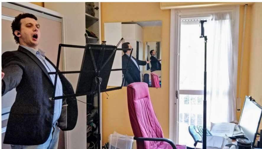
(left) Singing (from the diaphragm) for our virtual choir numbers