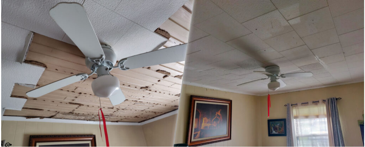
Ceiling damage from the hurricane