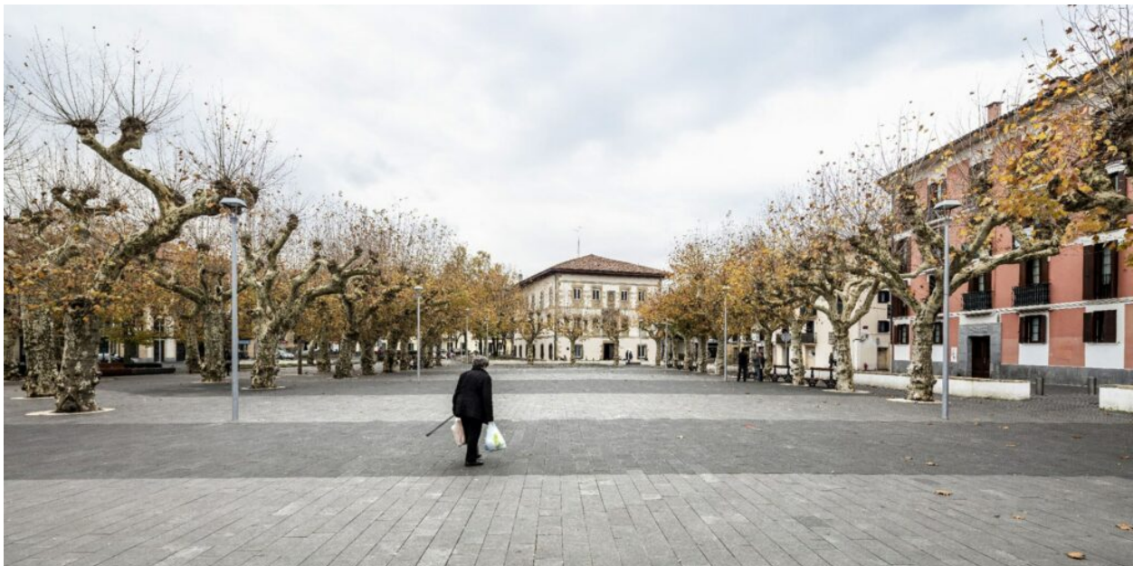
The plaza in the center of Irun. The building in the back is the Euskaltegia where I go every day for Basque classes.