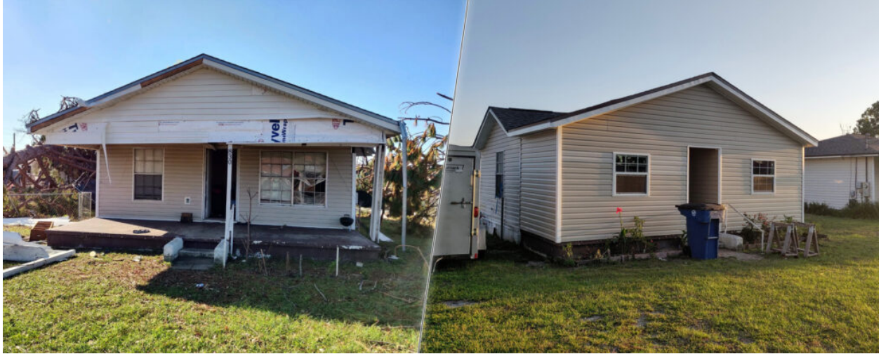
Before / After (in Panama City)