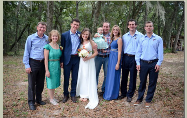
a new member of the family!