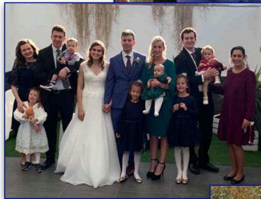
It is a very rare treat to have all four of our children together.

Here are some ministry pictures from recent months — however, it is much easier to follow our ministry through our website or social media. Thank you for praying and following what God is doing in the Basque region of Spain!