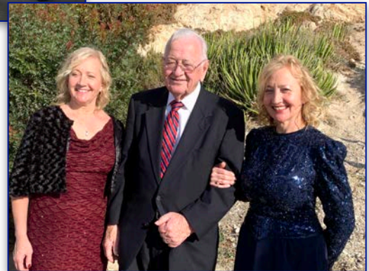
Mimi's dad and twin sister were able to fly over for the wedding as well!

Here are some ministry pictures from recent months — however, it is much easier to follow our ministry through our website or social media. Thank you for praying and following what God is doing in the Basque region of Spain!