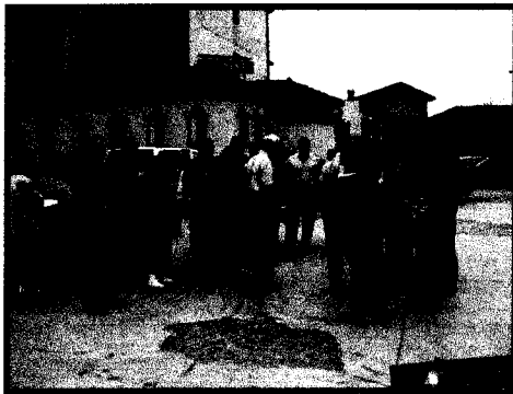
← Getting organized for tract distributing in one of our 13 target towns.

Each smile, all of the Spirit-filled music, every attempt to greet others in Basque, several thousand tracts distributed, and many other ministry efforts were part of the grand work of sowing the gospel to these people who have never heard. What a blessing to have them join us in our mission of sowing!