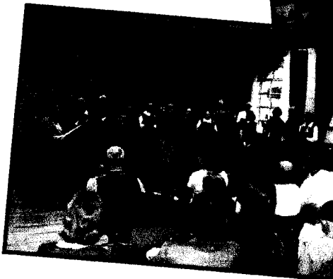
← Sacred concert at the Beasain City Hall.