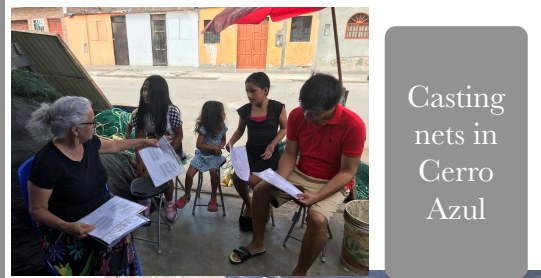
Casting nets in Cerro Azul

Thank you for so many, doing so much; sharing in this ministry through prayer and encouragement. Philippians 4:17-18