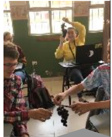
A Bible class illustration to the students of FN (Family Network Homeschool)