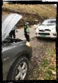
Pray for strength, safety and doors that are opening up!

My 2007 Hyundai did not do so well, but the Lord brought us back to Lima safely.