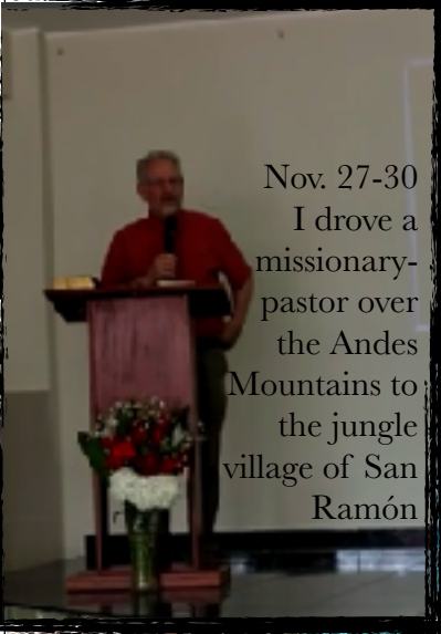
Nov. 27-30 I drove a missionary-pastor over the Andes Mountains to the jungle village of San Ramón

My 2007 Hyundai did not do so well, but the Lord brought us back to Lima safely.