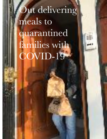
Out delivering meals to quarantined families with COVID-19