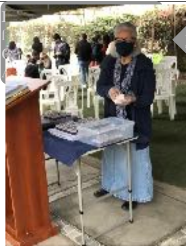
2 Churchplant photos.: Blessed be the Tie that Binds! August 29, 2021