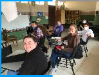
This is the new Bible class 8/9/21 I have started teaching two days a week "In-person" to Missionary Children.