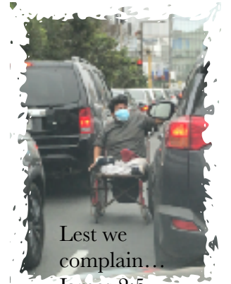
Lest we complain... James 2:5