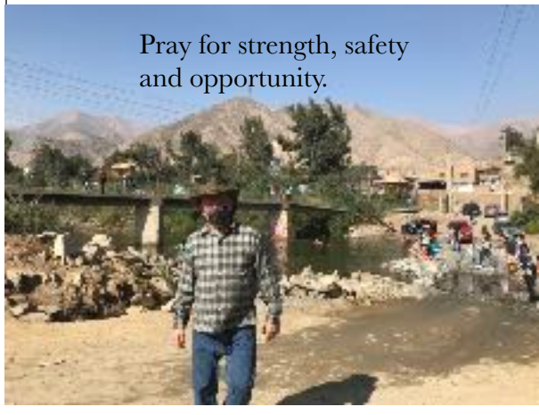
Pray for strength, safety and opportunity.