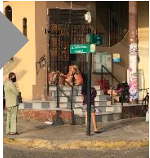
February 24, 2021

Our corner tienda wants to sell bread (in the bags) but the store is closed this Sunday. It reminds me of people wanting the Bread of Life but the doors to the church have been shut.