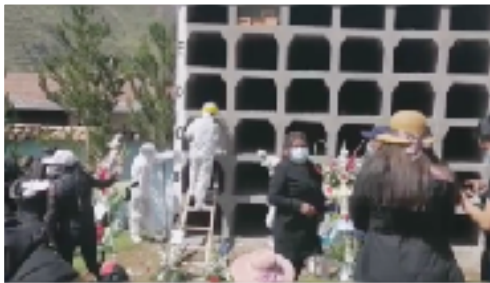
The number of deaths in the year 2021 is higher than in all of 2020.