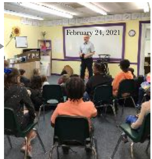
This year there are 109 Bible students in my Bible classes.

Please pray as I prepare and deliver 340 Bible lectures March - December.