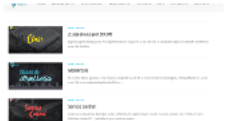
Online Church Links

I have no greater joy than to hear that my children walk in truth ...!!