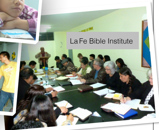
LaFe Bible Institute