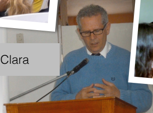
Preaching in Santa Clara