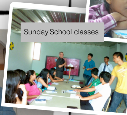
Sunday School classes