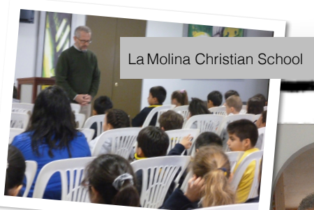
La Molina Christian School