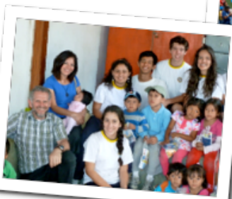
Our students on the Peru mis Manos extension ministry.

Finally, pray for an opening God has given me to start two Bible studies in our neighborhood. Each person that has approached me, God has sent, I'm sure. They would like to be the interpreters as I lead the studies. They already have a list of unsaved friends they are ready to ask to join us. My, My, My! This is the time to let the earth hear His voice, Praise the Lord, Praise the Lord! Let the people rejoice! I John 1:4 - read it!