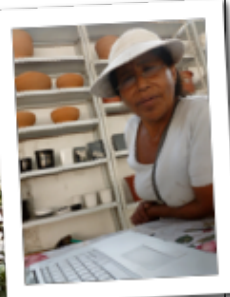
Giving the Gospel (in Spanish).