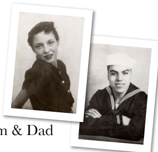
Mom & Dad