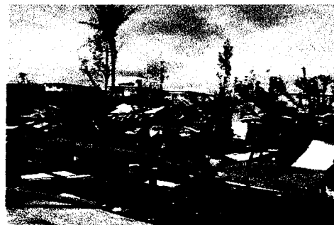
Was their house