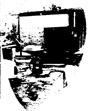
Now their house